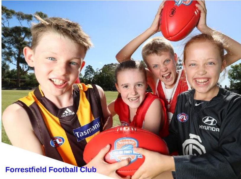
Forrestfield Football Club